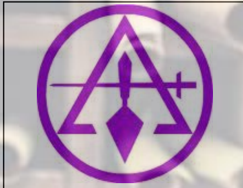
Orlando Chapter No. 5 Royal & Select Masters