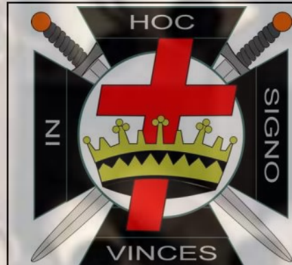
Olivet Commandery No. 4 Knights Templar