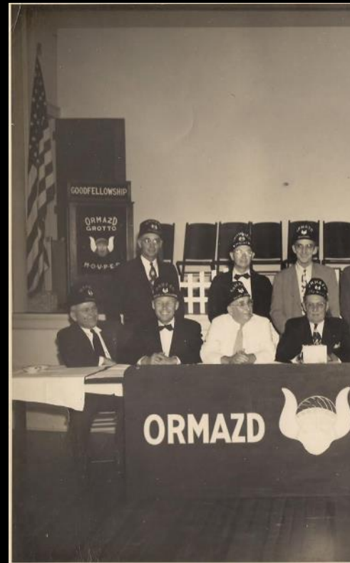
Unknown Ormazd meeting, possibly