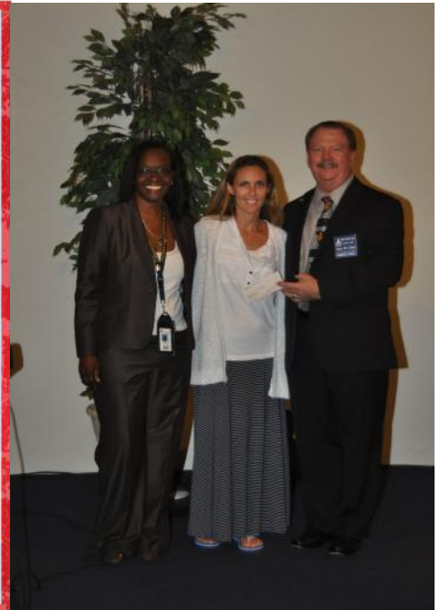
Helping our teachers

Winter Garden Masonic Lodge no. 165 F.&A.M.