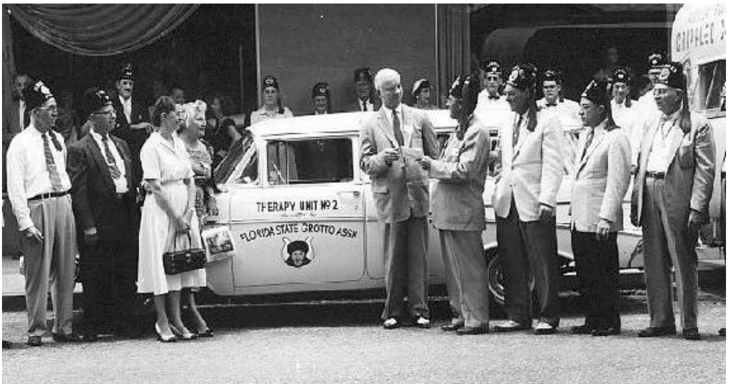
Florida State Grotto Association presenting a check to The Easter Seals Foundation Year, People, and Location unknown