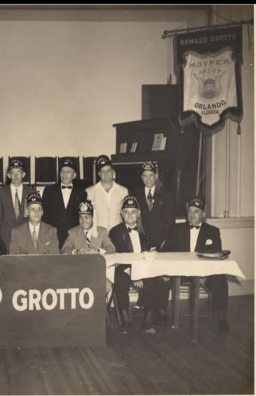
from the same 1946 meeting to the left