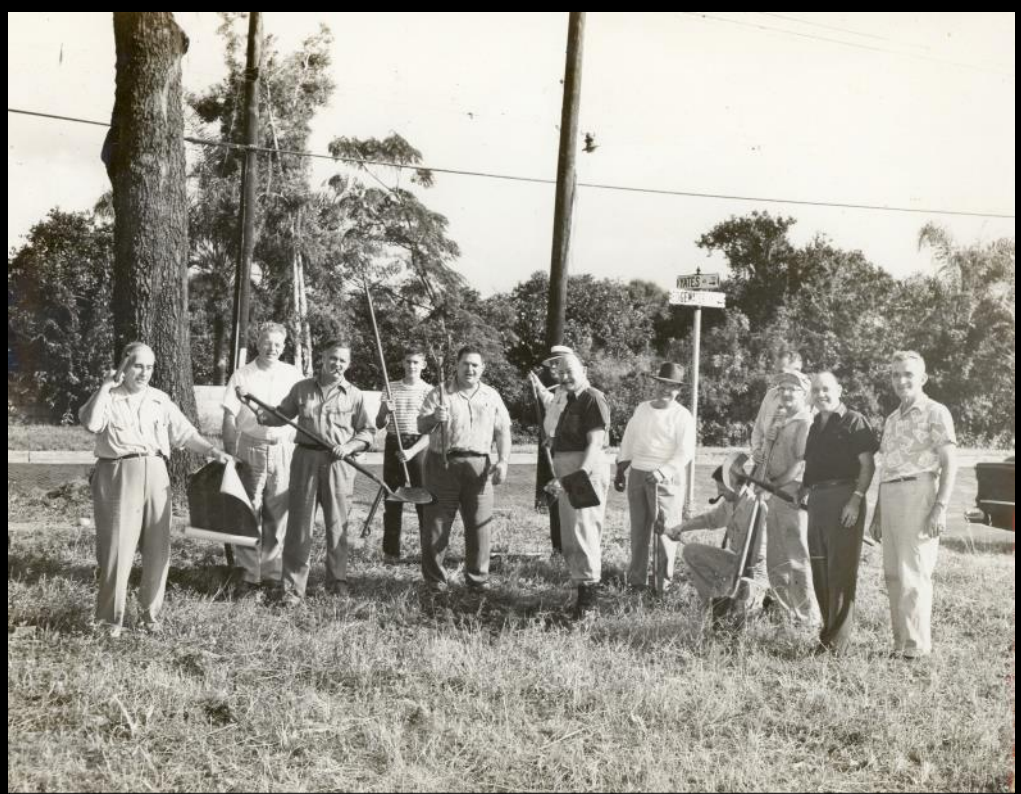
Breaking ground for our current Grotto building in the early 1950's