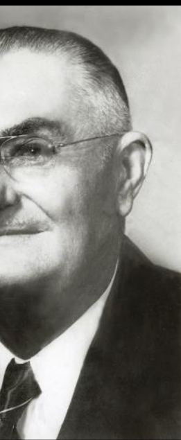
Quarter Monarch 1930