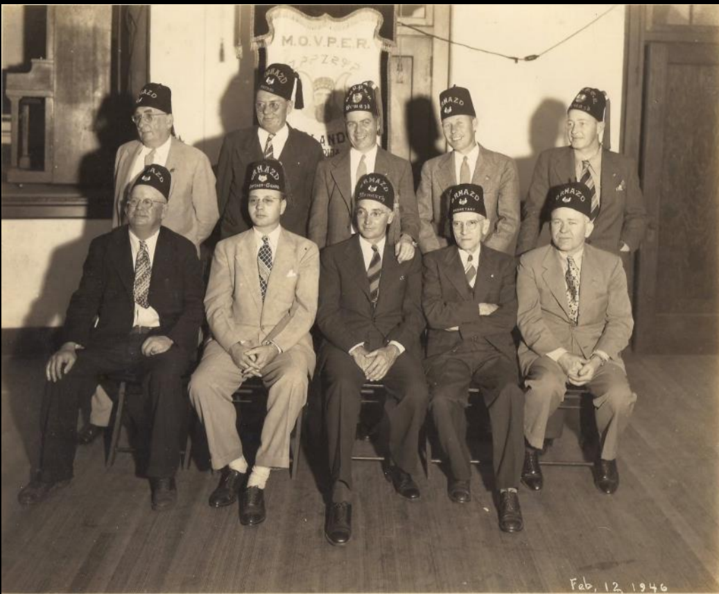
Feb. 12, 1946